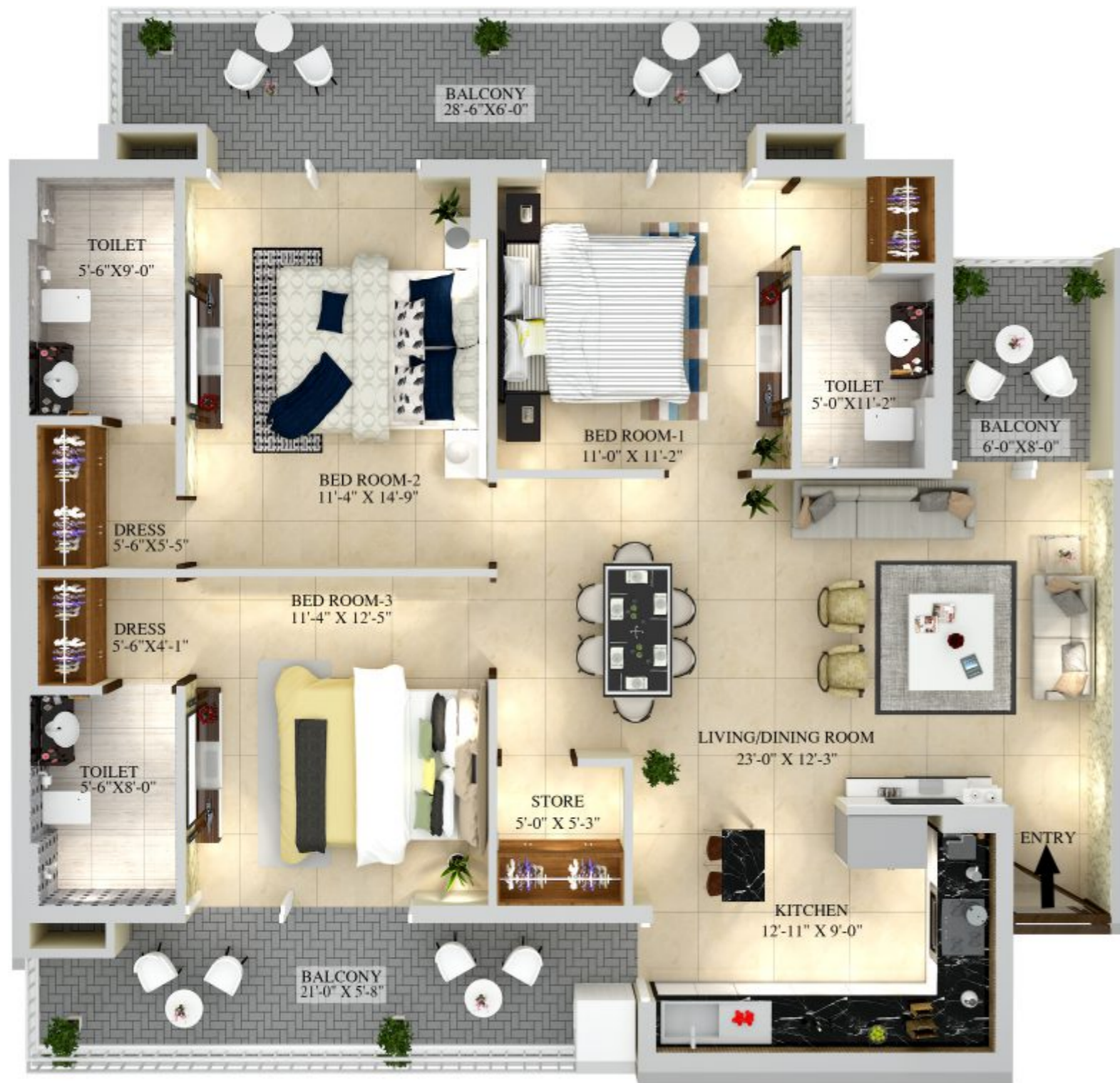
3 BHK - Tower : A, B, C, D, N, O, P, Q Carpet Area - 1110 Sq.ft. | Unit Area - 1549 Sq.ft. Super Area - 2100 Sq.ft.