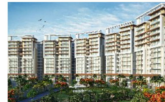
GREEN LOTUS SAKSHAM - ZIRAKPUR PATIALA HIGHWAY -