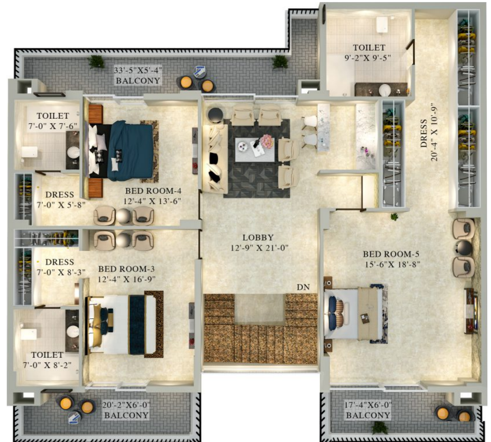
Duplex 5 BHK - Tower : J (Upper Floor)