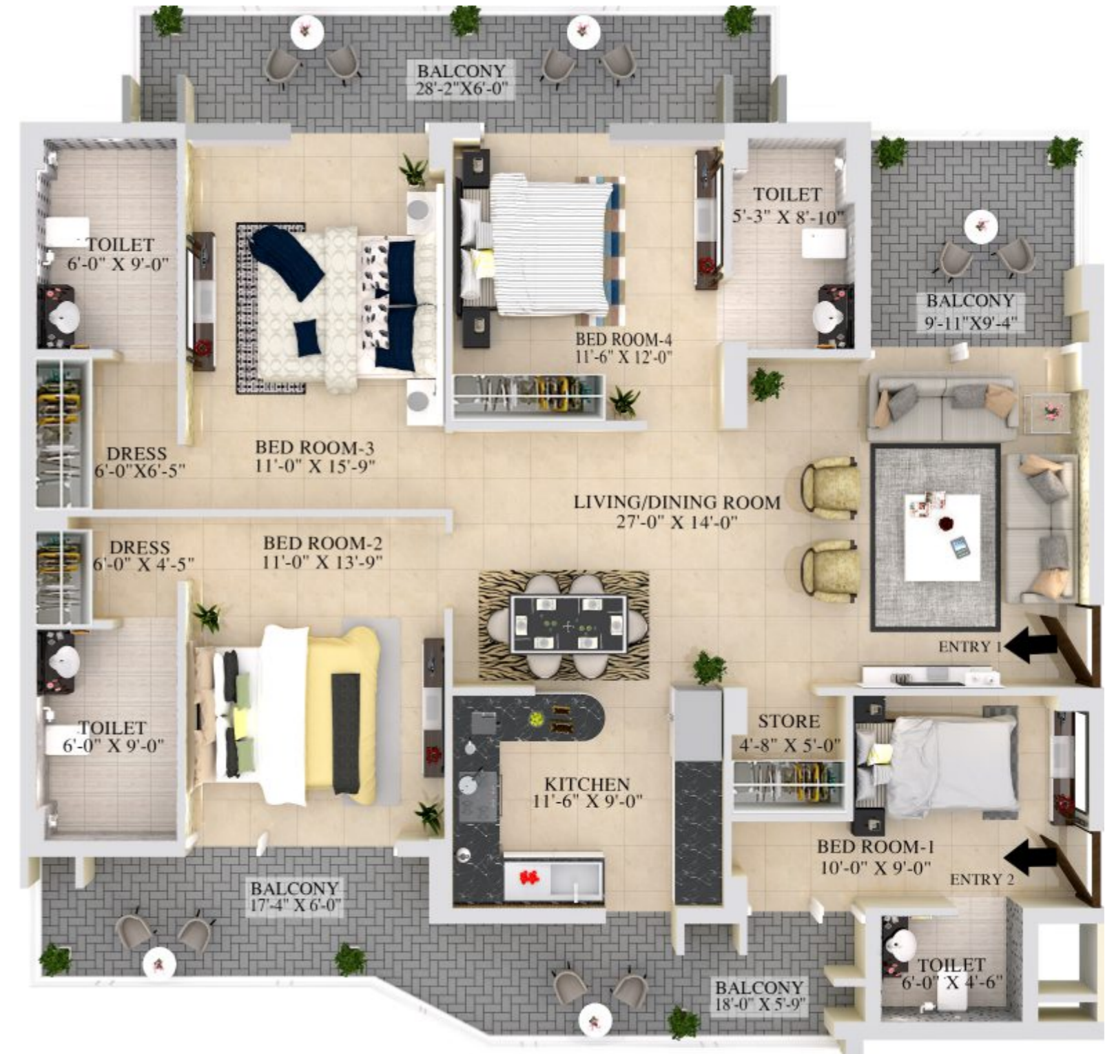
3 BHK + S - Tower : E, F, G Carpet Area - 1346 Sq.ft. | Unit Area - 1917 Sq.ft. Super Area - 2525 Sq.ft.