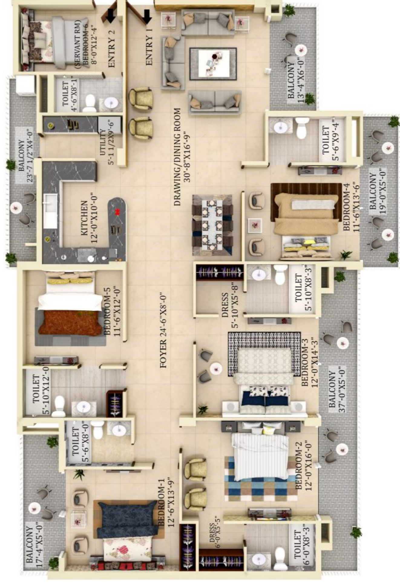
5 BHK + S - Tower: H, I Carpet Area - 2233 Sq.ft. | Unit Area - 2933 Sq.ft. Super Area - 3785 Sq.ft.