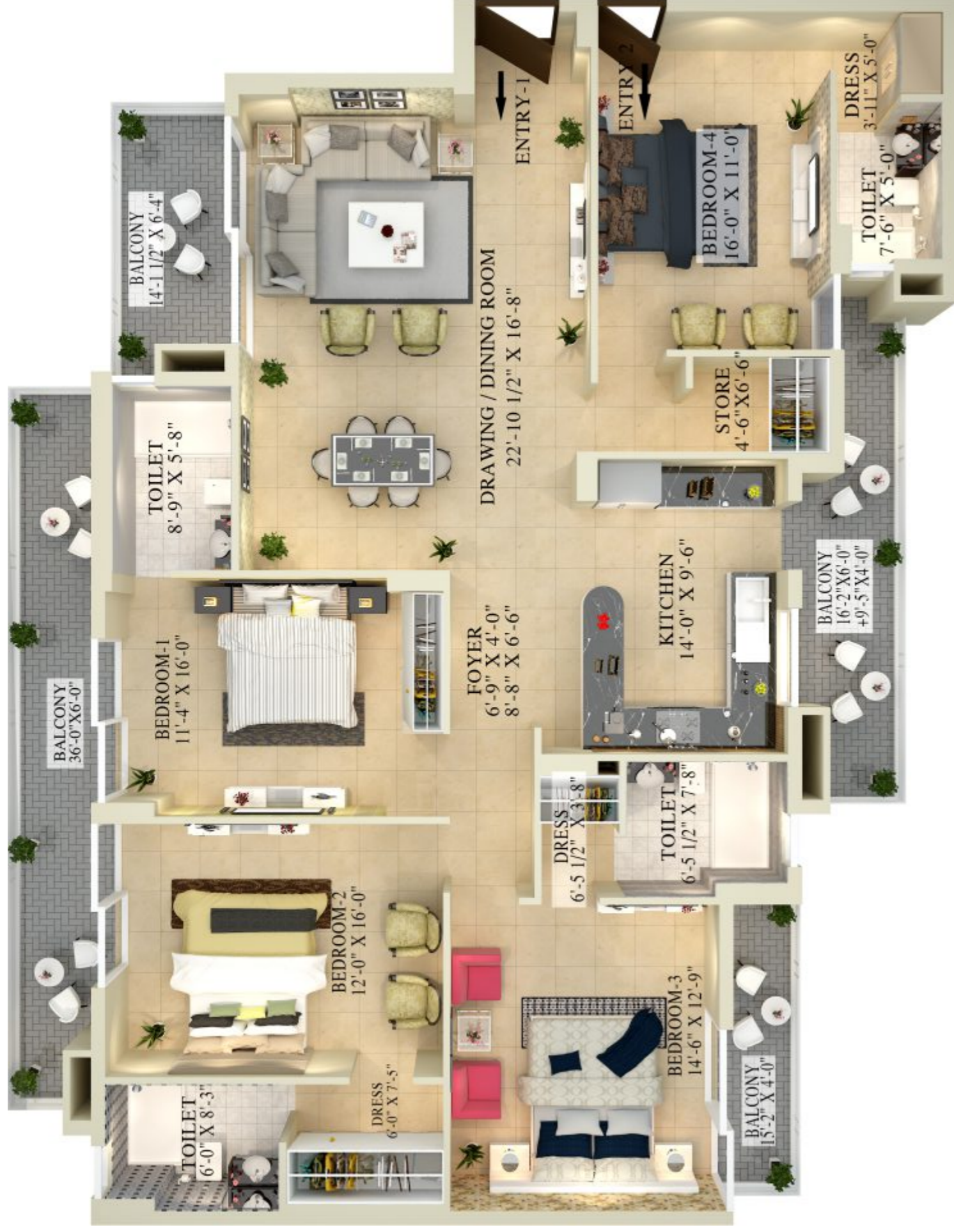
4 BHK - Tower: K, L, M Carpet Area - 1741 Sq.ft. | Unit Area - 2363 Sq.ft. Super Area - 3130 Sq.ft.