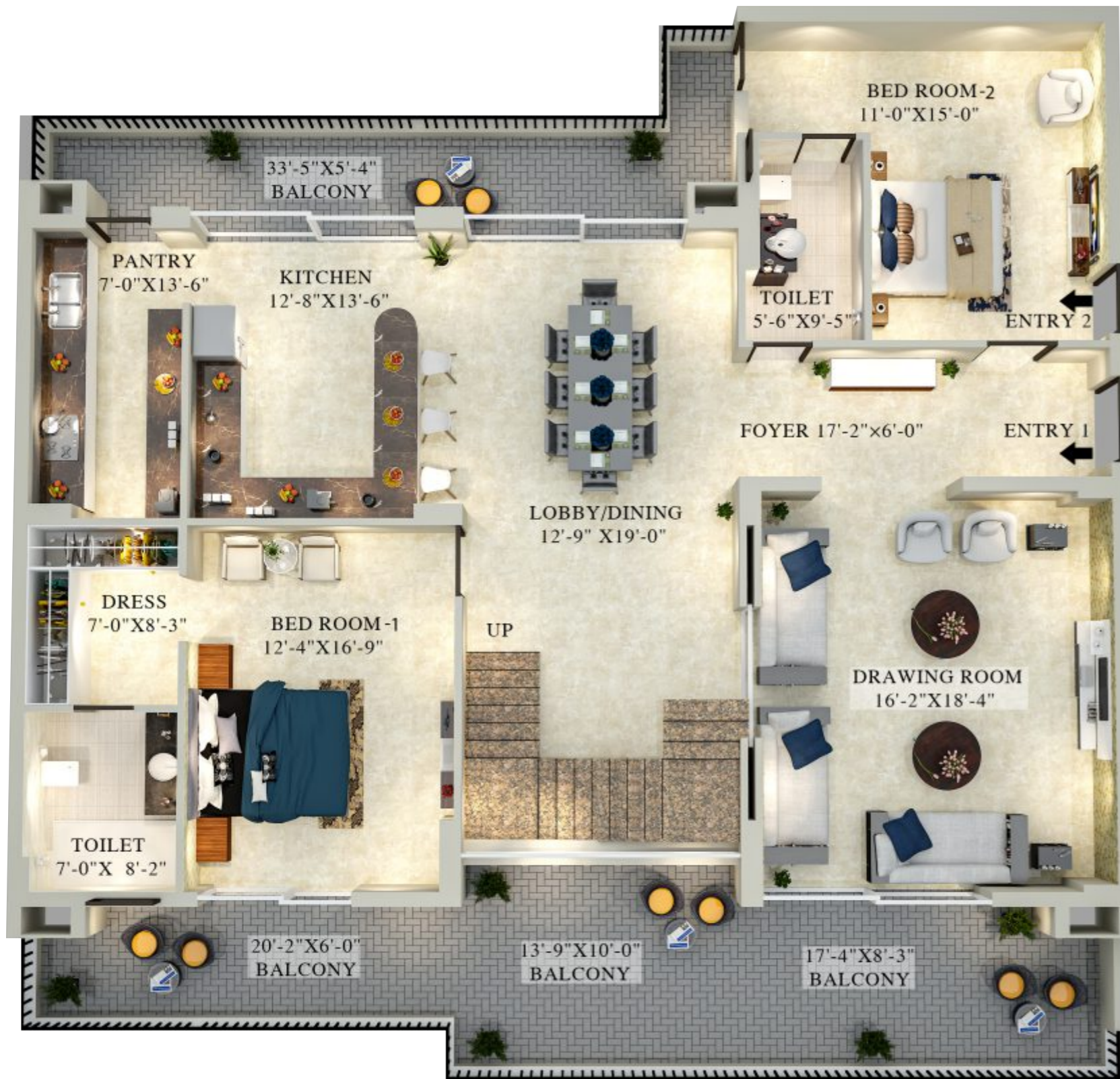
Duplex 5 BHK - Tower : J (Lower Floor) Carpet Area - 3323 Sq.ft. | Unit Area - 4559 Sq.ft. Super Area - 5750 Sq.ft.