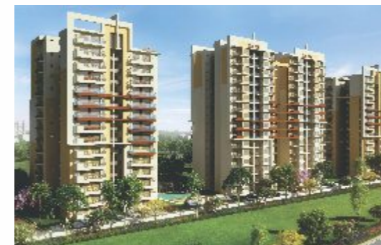
GREEN LOTUS AVENUE - CHANDIGARH AMBALA HIGHWAY -